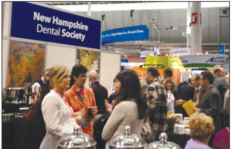
Some of the large group who joined us for the NHDS reception at Yankee.